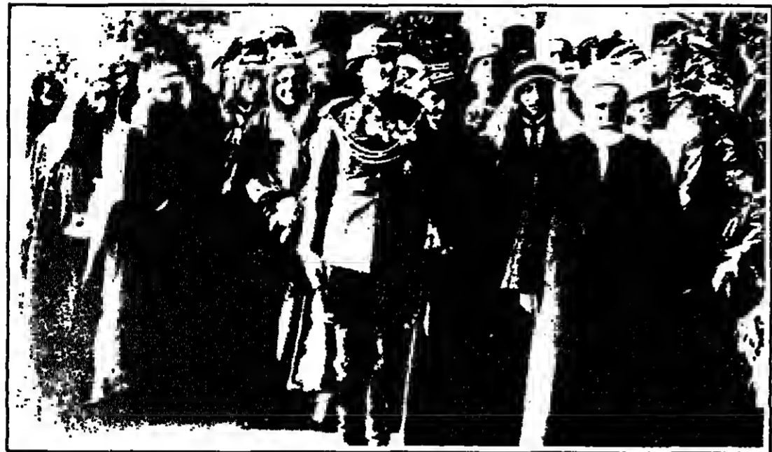
The late King Hussein Ibn Ali (right) arrives in Amman in 1924. Behind him is then-prime minister Hassan Khaled Abul Huda. The uniformed officer is Arab Legion Commander Frederick Peake Pasha. The late King Abdullah Ibn Al Hussein is seen at far left.

The department is also about to begin planning and constructing a suitable building to house documents. JD 3 million has been allocated for the construction which will house archives, documentation and libraries. It will be completed within the current five-year development plan.